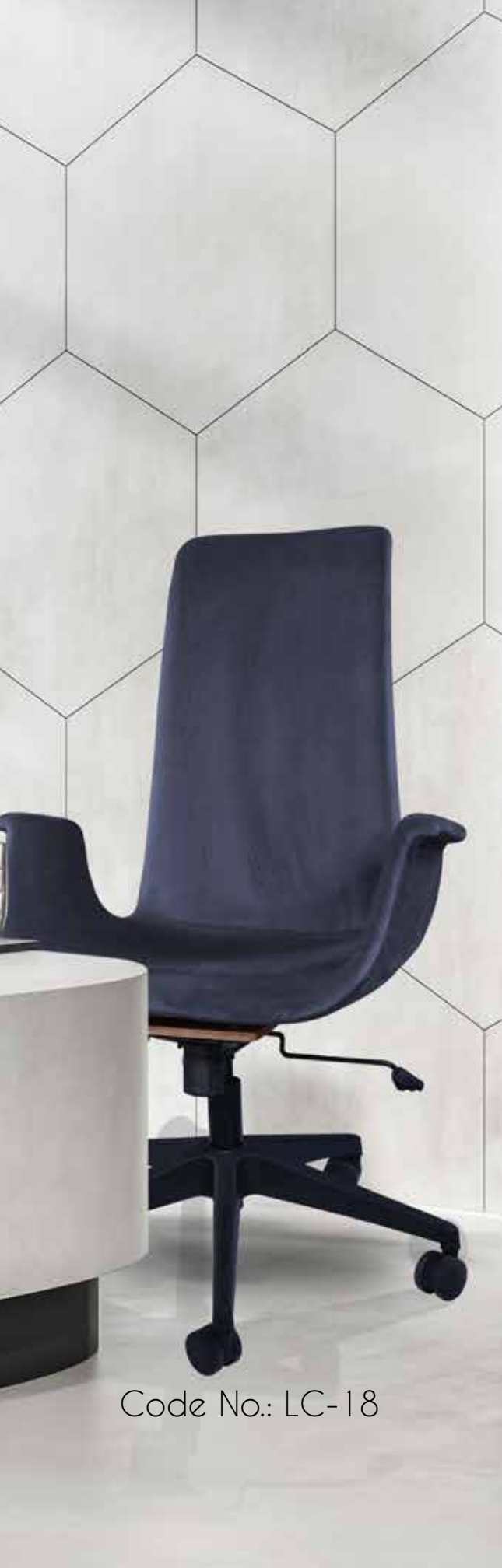
Code No.: LC-18